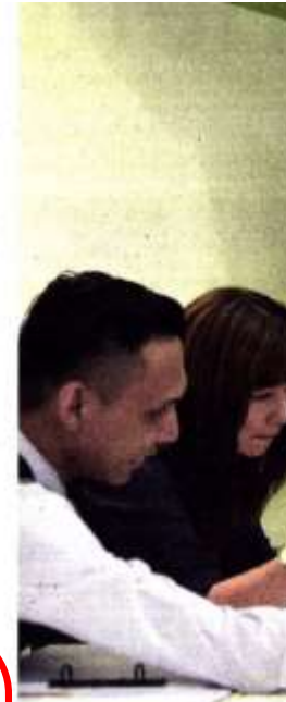
NTUC Learning Hub prepares its stu

It is part of the SkillsFuture national movement to help Singaporeans embark on a learning journey to